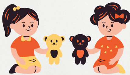
Difficulties with social interaction