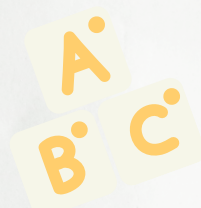
Delayed cognitive or learning skills