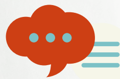
Delayed language skills